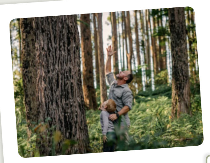
Your Guide To Northern NSW Native Forest Trees

Scan the QR codes to access some of our most popular blog articles, with more than 20 articles to explore.