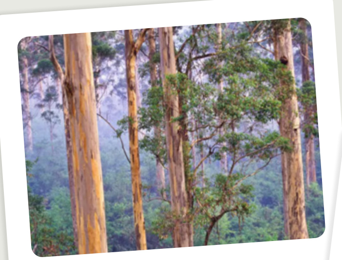
Your Guide To Australian Timber Values

We pride ourselves in providing our clients with guidance and expertise on sustainable forest management.